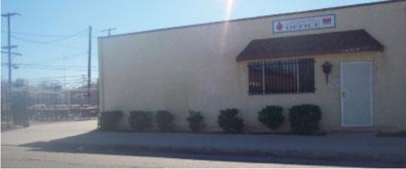
45058 Trevor – Site 1, Suite B