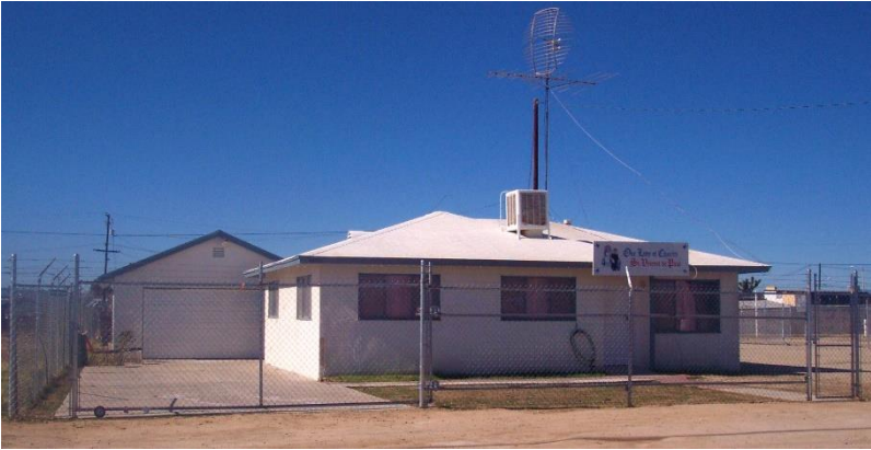
44721 Trevor – Site 2