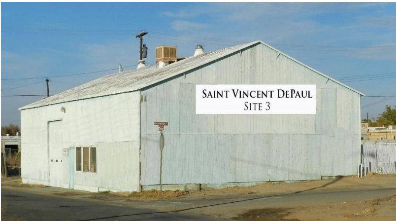
44532 Trevor – Site 3